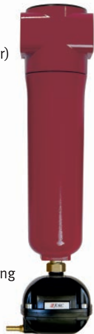
The filter is an image offered by Walker Filtration Ltd. with the aim of presenting the MINI-MAG under a filter. JORC does not sell filters