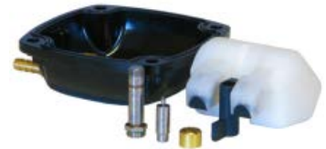
Easy to maintain

To simplify the installation process, the top half of the MINI-MAG can be rotated 360°.