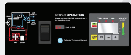
Intuitive Smart Controller