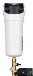
AUTO DRAIN OPTION