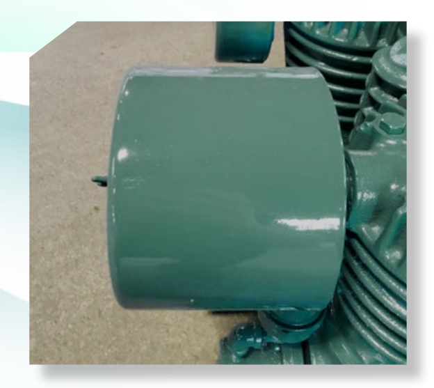
Quiet Intake Filter Oversized air filter reduces noise level of the air compressor

Increases the life of the tank and the compressed air's quality by automatically removing moisture from the tank. Pneumatic-controlled tank drain is used on 5 HP models and lower. Electric automatic tank drain is used on models 7.5 HP and greater.