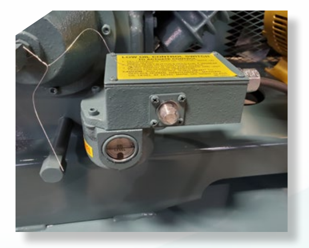
Low Oil Control Protects the compressor pump from damage due to lack of lubrication