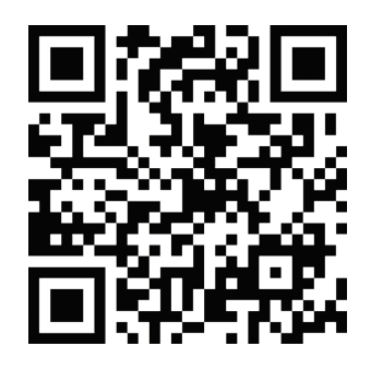
Scan to download the Oniverse App