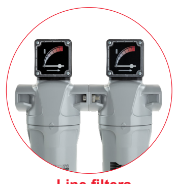
Line filters Can be added for high-quality air.

Thanks to its wide range of options and flexible build, the QRS 3-10M can accommodate all your requirements.