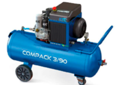
On tank (90 Lt)