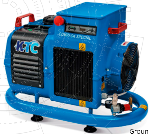
Grounded with 2,5 liters tank