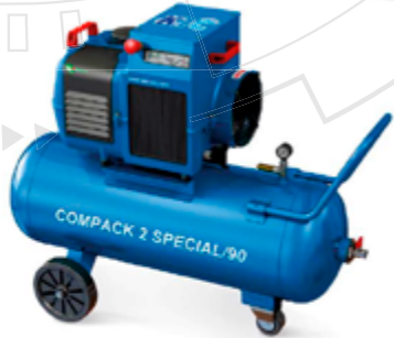
On tank (90 Lt)