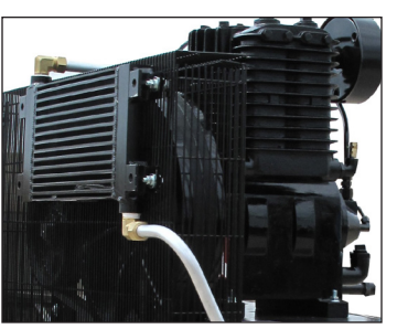
Air cooled after cooler Elite unit