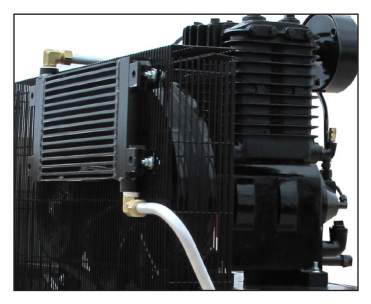
Air cooled after cooler Platinum unit