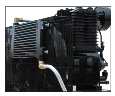
Air cooled after cooler Platinum unit