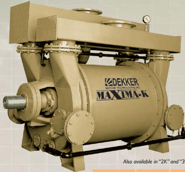
Also available in "2K" and "3K" design