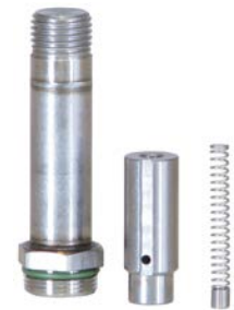
JORC's direct acting valve assembly, offering you reliability