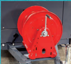
Single Hose Reel Kit