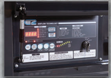
1 | Keyed Start and Digital Monitor with Eco and Eco Auto Idling Modes