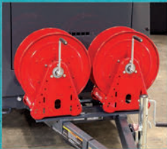
Double Hose Reel Kit