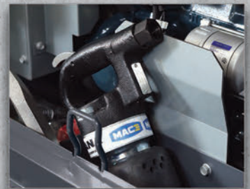
6 | Interior Storage Compartment Holds a 90# breaker or other air tools

BEST-IN-CLASS POWER TRANSFER // FUEL EFFICIENCY // dBA RATING THE INDUSTRY'S HIGHEST-QUALITY MOBILE AIR COMPRESSORS