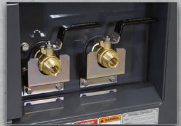
3 | Air Connections 3/4" Male Ball Valve x 2