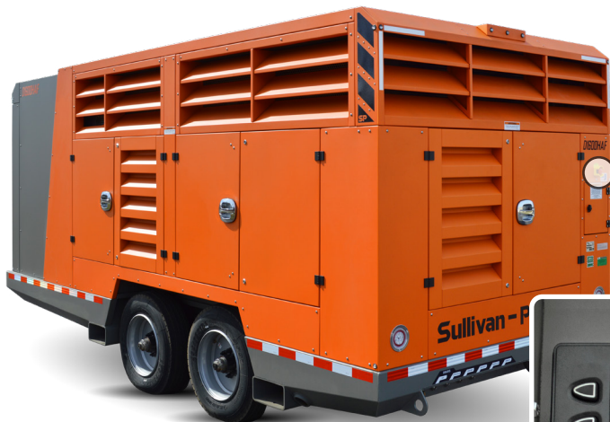
Sullivan-Palatek Electronic Controller (SPEC)