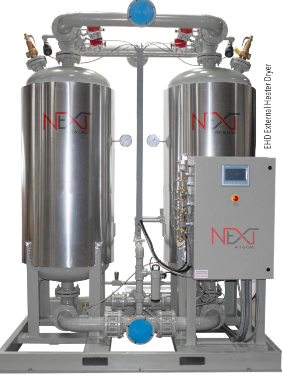
Unit shown with optional tank insulation with safety jacket.

In External Heater models, purge air is heated then passed over the bed to regenerate it. These are custom designed products, and we provide design and engineering assistance as needed to manufacture these unique systems. Should you need guidance determining which type of dryer works best for your operation, our experts are happy to analyze and make recommendations.